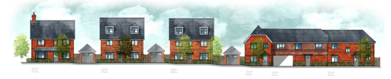
Proposed street scene plots 18 - 21 and plots 67-73 (south of site):